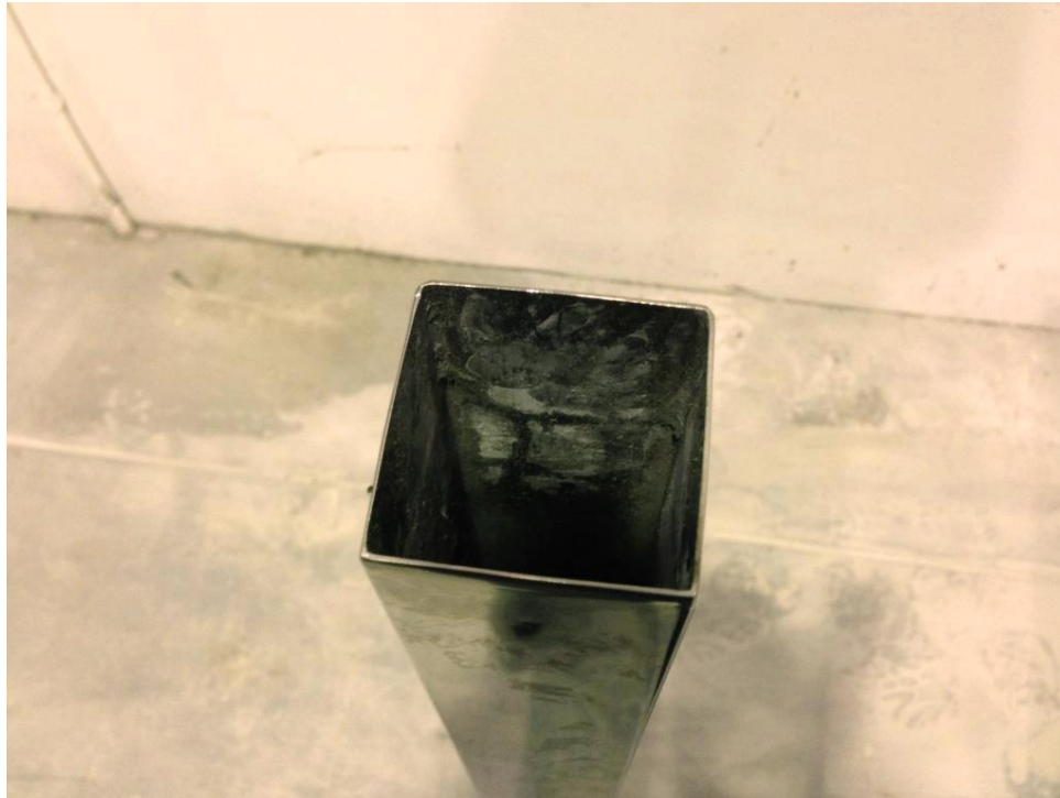
The square stainless steel post