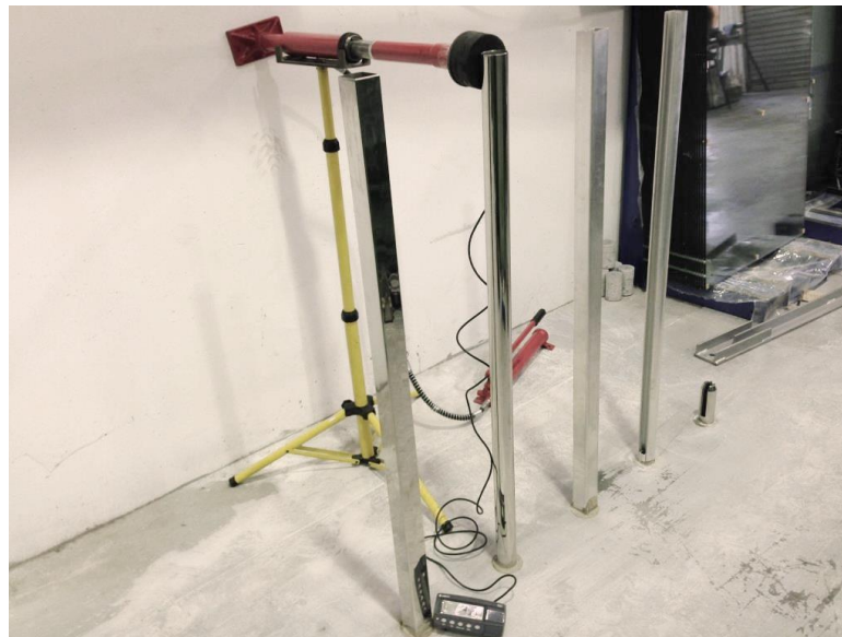
The post under test.

Requirements No permanent damage or looseness of footings.