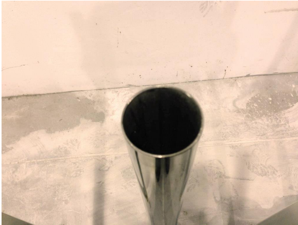
Round stainless steel post