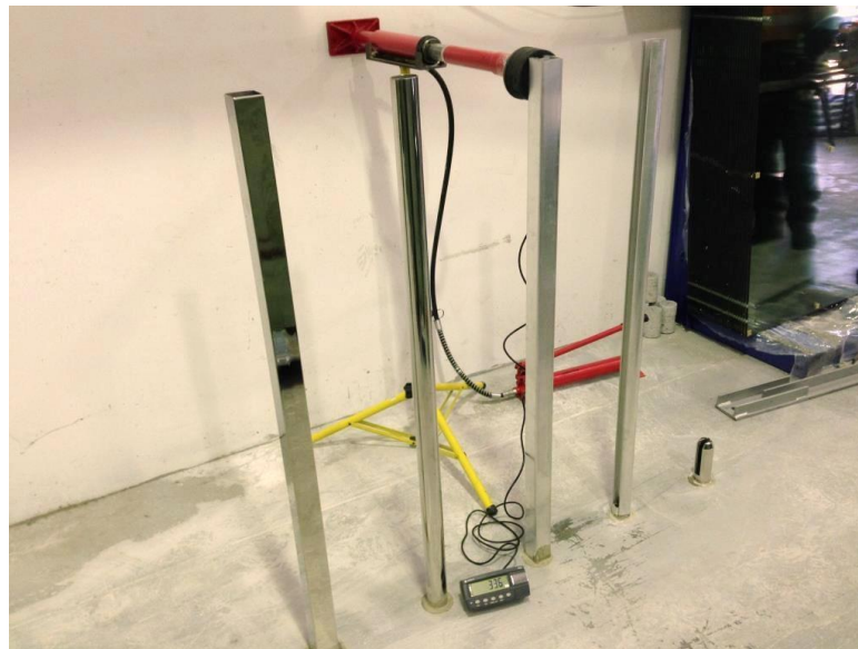
The post under test.

Requirements No permanent damage or looseness of footings.