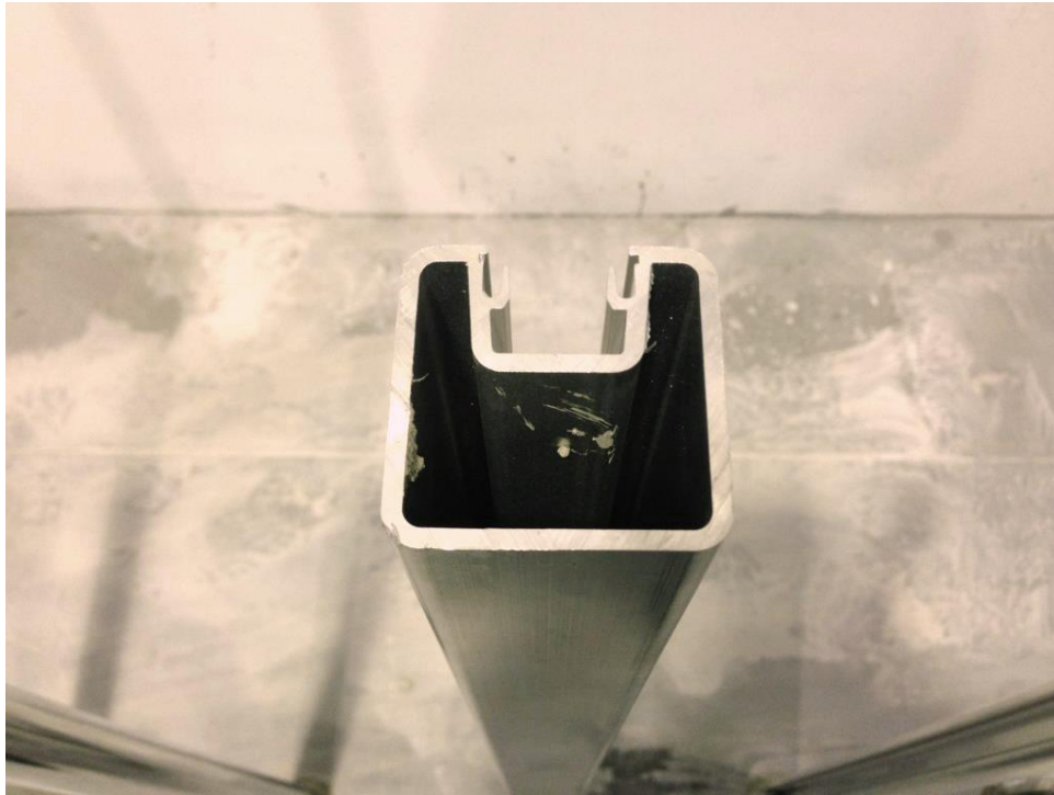
The square aluminium post.